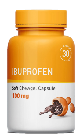
| IBU 100 mg | Chewgels<sup>TM</sup> | Adults