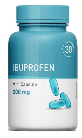
Mini Softgel Adults